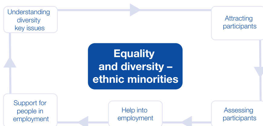
Figure 1.1 Structure of the guide

The guidance is structured in accordance with the main steps through which an ESF applicant may pass on the journey from worklessness into employment and beyond. Case studies detailing how outcomes were achieved are included in each section.